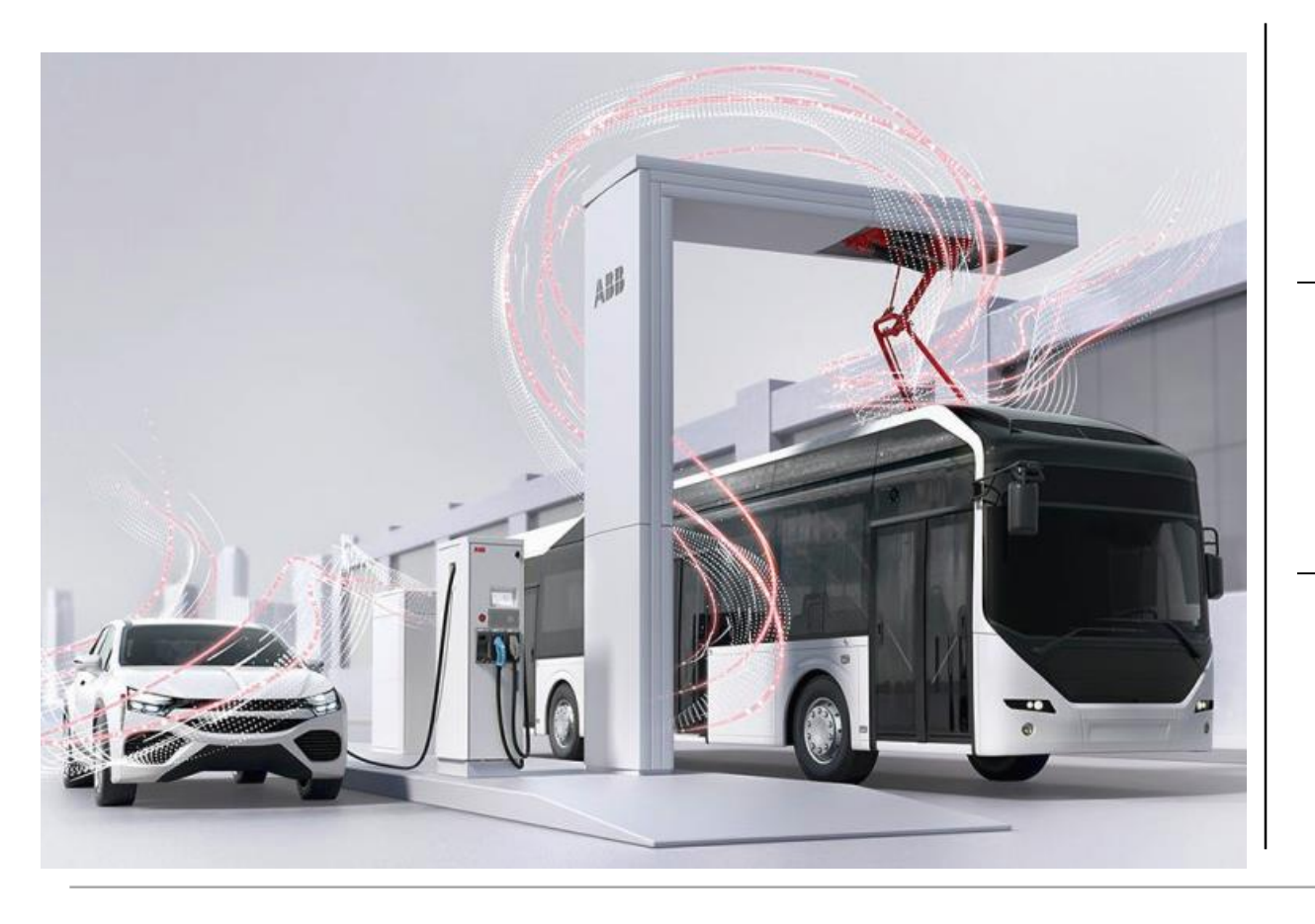
ABB as leading technology provider

Nationwide fast charging network supplied by ABB in the Czech Republic and Bulgaria, growing network in Slovakia and Poland.